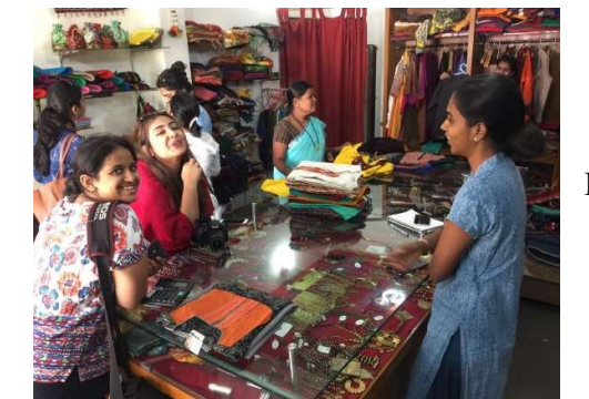
d. Students from Shristi School of Design visited to see the artisanal work of Sabala.